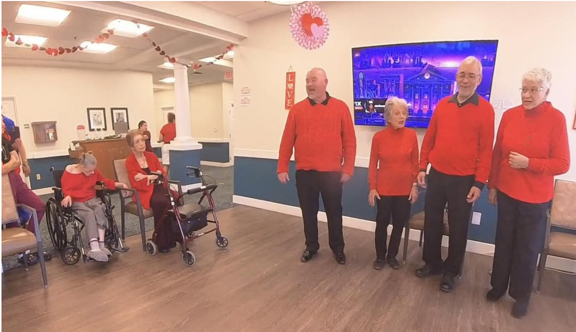
Mixed MetaFour delivering a Singing Valentine